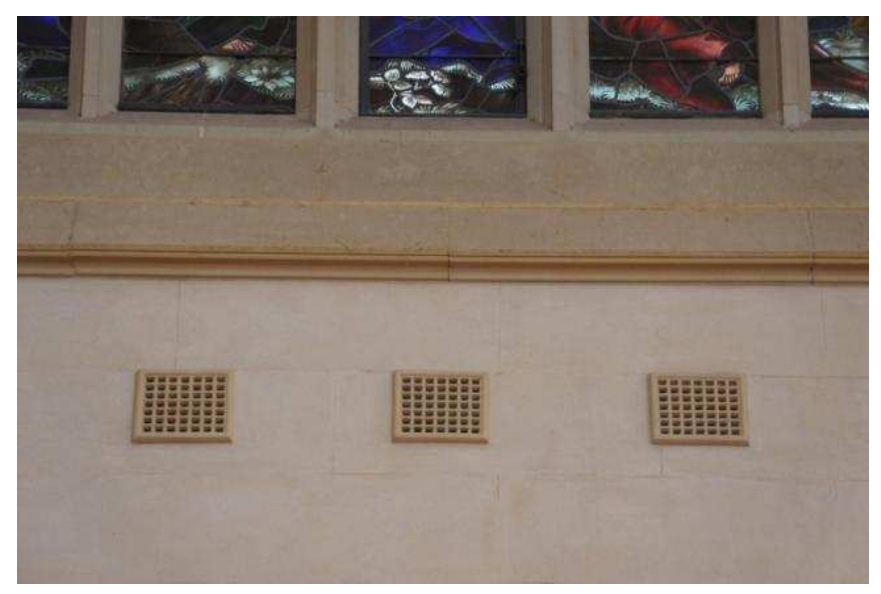
Fig. 8. Detail of the elements of the ventilation system - exhaust grilles. Visible effect of properly chosen elements to the historic character of the cathedral interior