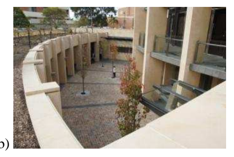
Fig. 12. View of how to connect the underground parking with the building of the cathedral: a) a footpath leading to the parking lot and sanitary facilities, b) view of the parking area within one of the aisles of the cathedral

Worth mentioning is the skilful - according to the author - combination of the historic character of the Cathedral with modern urban architecture. This was achieved by a well-known effect of a styles contrast: historical part - modern part [4].