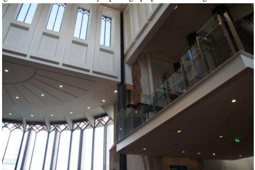
Fig. 9. Detail of lighting elements of the cathedral aisles. Visible "discreet" modern lighting fixtures with high efficiency

The given effect is illustrated by a photograph presented in Figure 9.