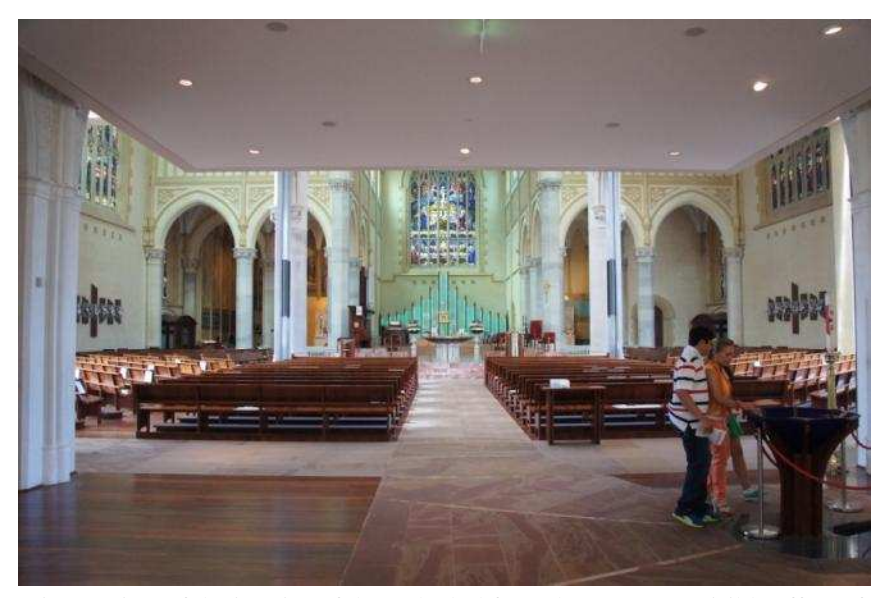
Fig. 4. View of the interior of the cathedral from the entrance. Visible effect of increasing the usable space of the object by mounting double-sided aisles and additional lighting