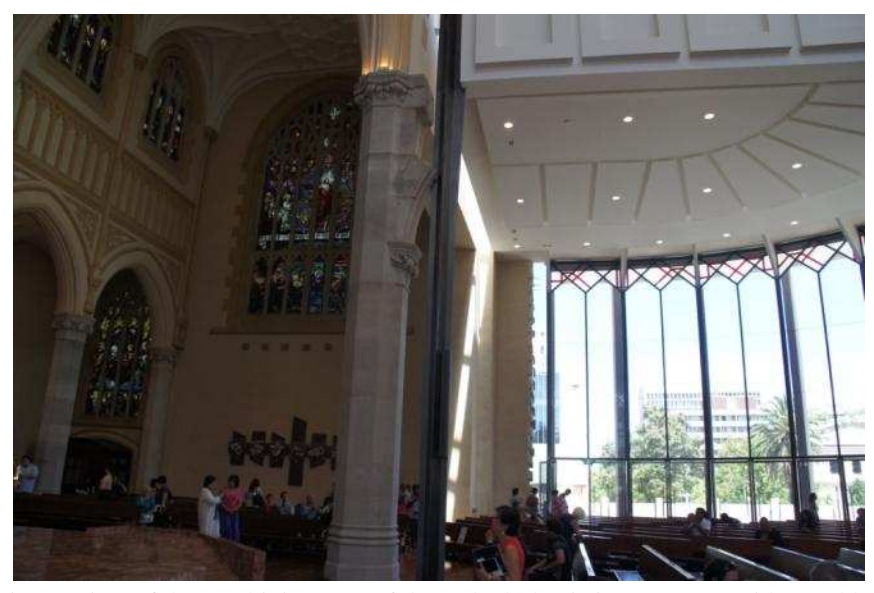
Fig. 5. View of the combining area of the cathedral existing structure with an added aisle. Visible pillar of steel structure next to the historical pillar made of sandstone