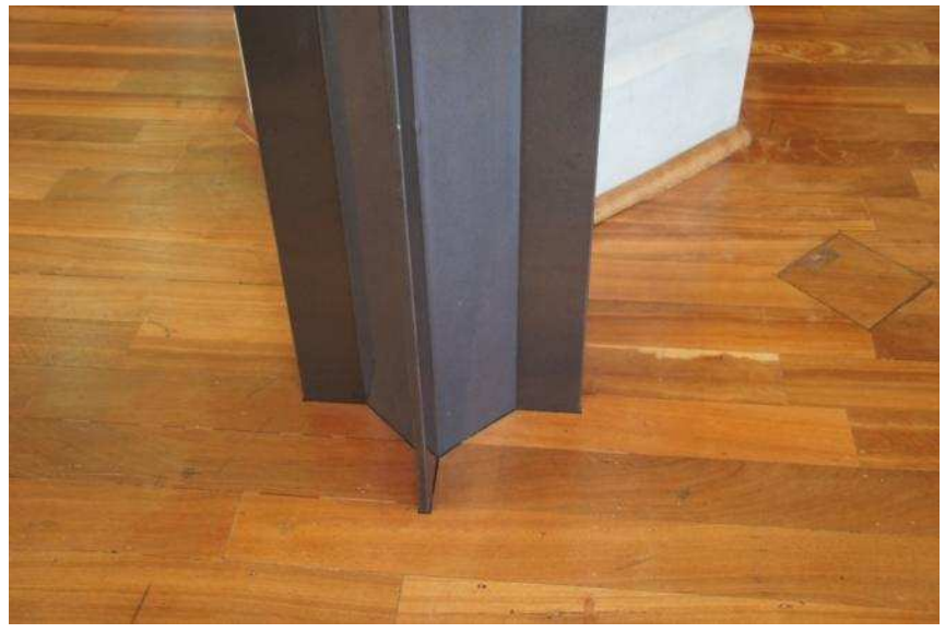
Fig. 6. Zone detail of "penetration" of column base by the design of the floor. Visible special section of the pillar limiting the number of stiffeners (battens and ribs) - in order to eliminate unsightly, in this case, architectural details