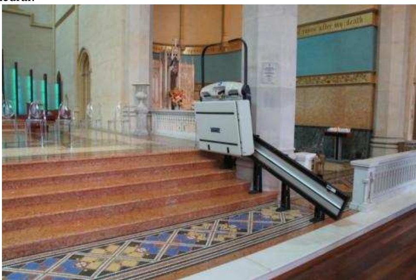
Fig. 10. Example of devices that facilitate the use of sanctuary for disabled and elderly people - ramp that allows overcoming the stairs leading to the altar

rebuilding plans one included the construction of additional parking spaces in the form of a full-scale underground car park, situated under the building of the cathedral.