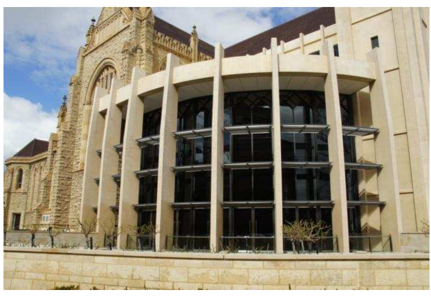
Fig. 3. A general view of one of the attached aisles, aimed at increasing the usable area of the object. Clear way of combining "the new" with "the old" - in the background view of the historic facade of the cathedral