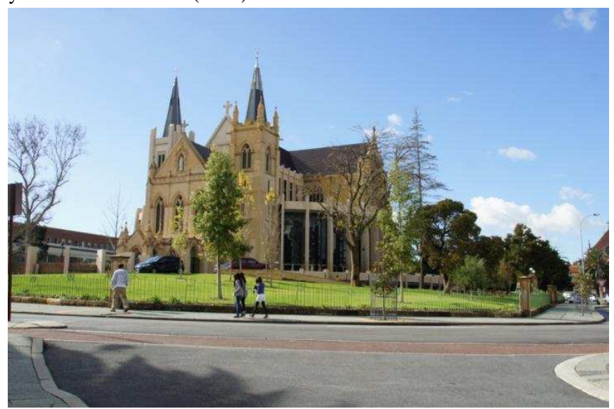
Fig. 1. General view of St Mary's Cathedral in Perth - Western Australia

St Mary's Cathedral, Perth (the capital of Western Australia) - whose official name is "Cathedral of the Immaculate Conception of the Blessed Virgin Mary" - is one of the largest religious buildings of the Archdiocese in this city. The present cathedral is located on Victoria Square in the centre of Perth. In the photo placed in Figure 1 one presented a general contemporary view of St Mary's Cathedral in Perth (2014).