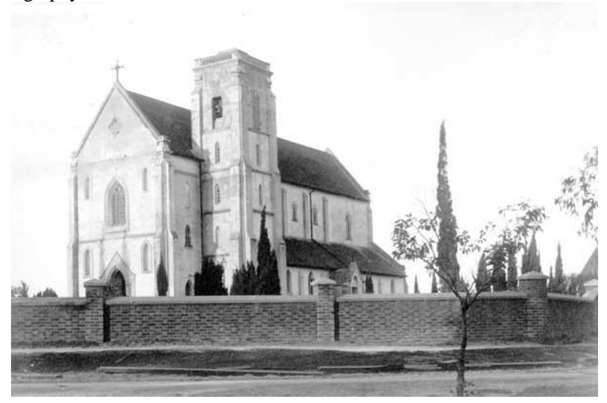
Fig. 2. General view of the sacral building in its original architectural design from 1894.

The main architect responsible for the construction work was Joseph Ascione - originally from Italy. The cathedral was consecrated and opened on 29 January, 1865. Figure 2 shows a view of the sacral building in its original form - photography dates back to 1894.